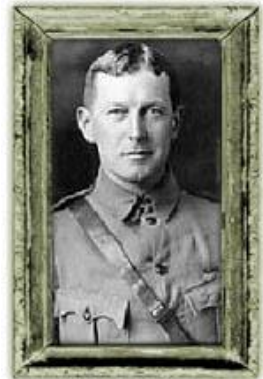
Lt. Col. John McCrae (1872-1918)